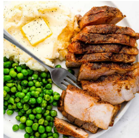
Boneless Pork Chop