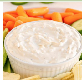
House Made Dill & Onion Dip

https://pci.jotform.com/form/260915977459172