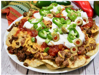
Pasture Fed Ground Beef

Quality Meats. Humanely Raised. Sustainably Sourced.