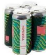
Hopewell Lightbeam IPA