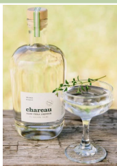
*New Chareau Aloe Liqueur - 750 ml