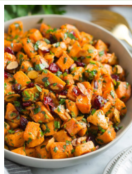
Sesame Sweet Potato Salad