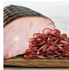
Applegate Black Forest Ham