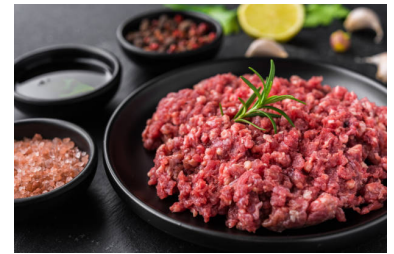
Pasture Fed Extra Lean Ground Beef